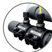
Pre-assembled injection points