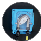
pH dosing pump