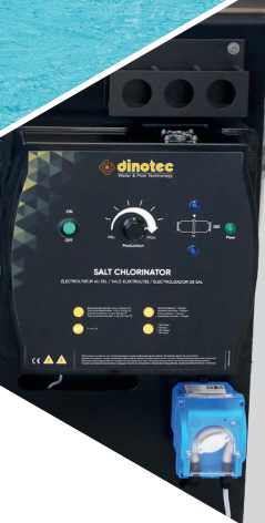
Dinotec salt chlorinator

Low noise level thanks to the integrated flow regulator