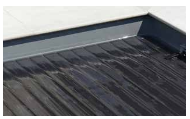
Our custom-made slats align perfectly with the edges of your pool.