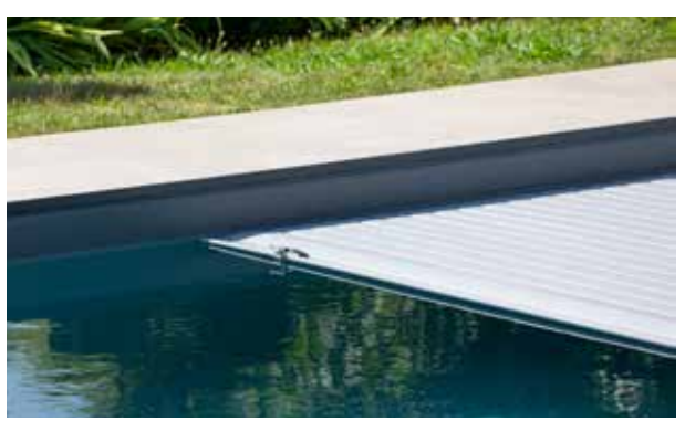
Our custom-made slats fit your pool shape to perfection.